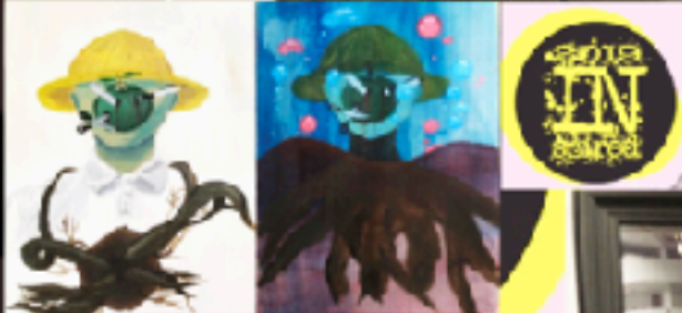
Shun Fukai: The Seen Unseen