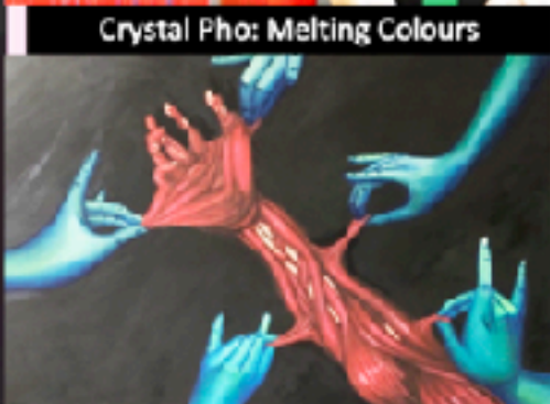
Crystal Pho: Melting Colours