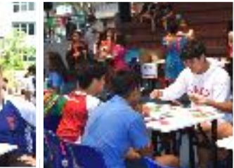
Parent Led Activities